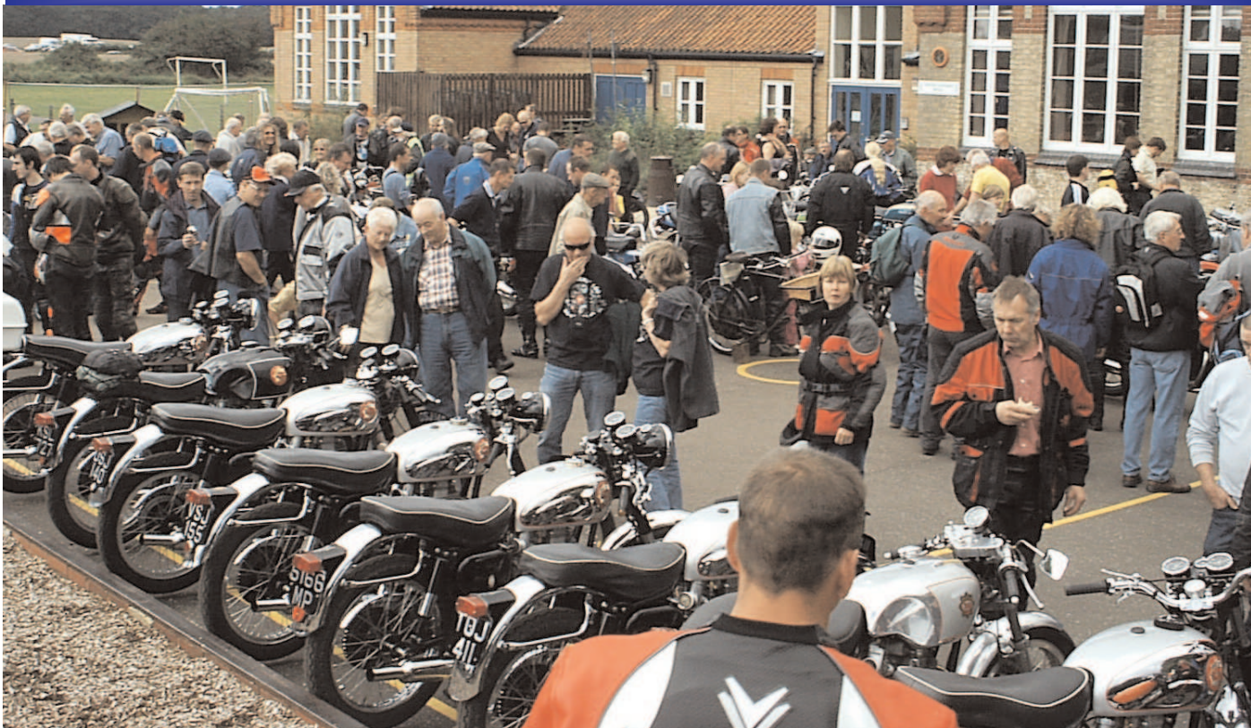
The Fenman nr Kings Lynn a day event where thousands of local bikers show off their many different machines all in aid of the local town, here we seen just some of the many BSA Gold Stars