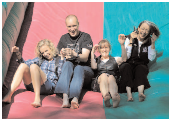
Two pictures, BBQ and slide at 2009 CMA Rally Same site for the EMC CMA Rally 2010