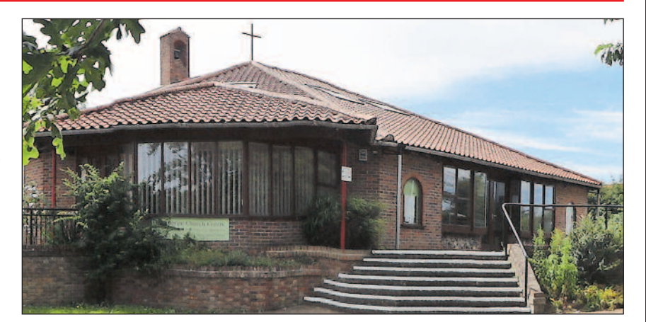
Bowthorpe Church which needs roof repairs.

In the 14th and 15th centuries the same stone that used in the building of Norwich Cathedral was used to enlarge the church which eventually became a ruin in the 1790s.