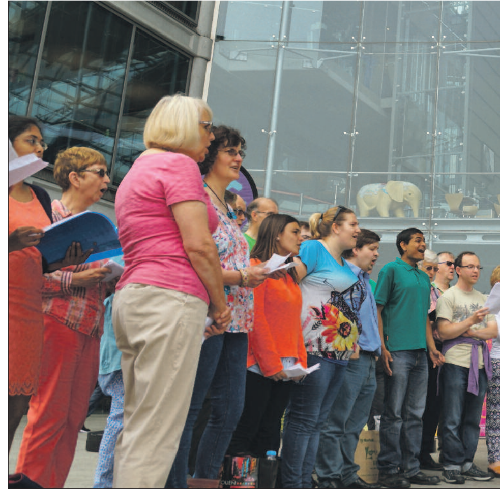
Above, Celebrate Norfolk at the Forum in Norwich, right at the Royal Norfolk Show and, far right, in King's Lynn.

Many of the churches and Christian organisations of King's Lynn had come together to stage a free community fun day, blessing