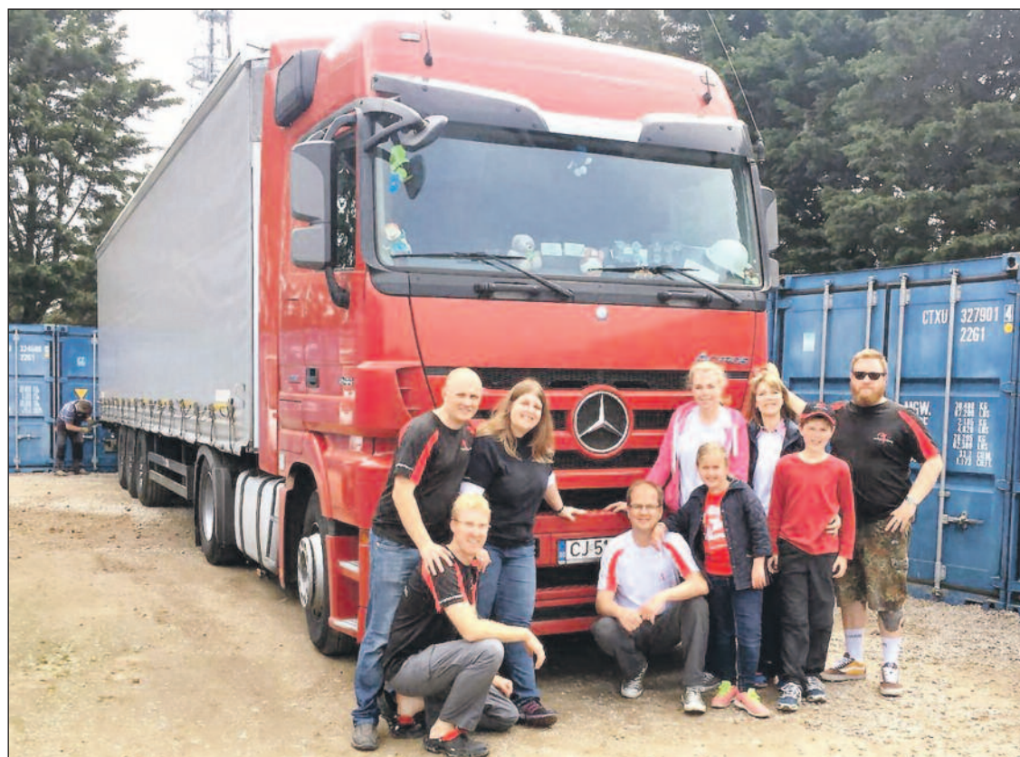
South African Christians in Norwich loading up a 10-ton truck with aid for churches in poverty-stricken areas of Romania, surrounded by storage containers.

Members and friends have achieved remarkable goals in providing overseas aid - for