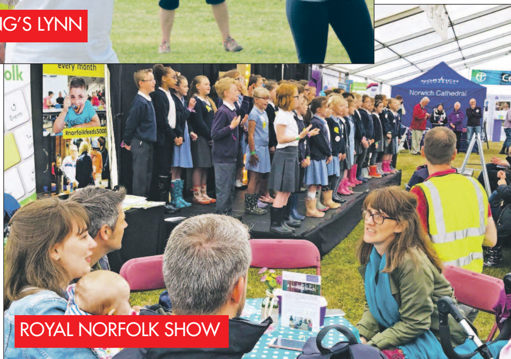
ROYAL NORFOLK SHOW

Celebrate will be showcasing the Christian church in action at The Forum in Norwich, above, the Walks in King's Lynn, left, and the Royal Norfolk Show, below.