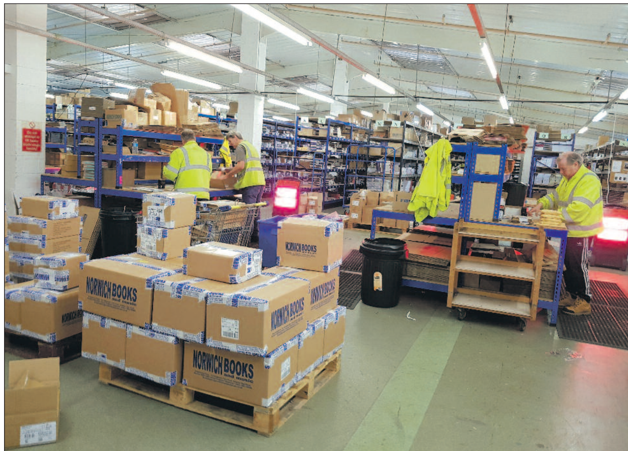
The Hymns Ancient and Modern distribution centre in Norwich.

Find out more about our work and our grants programme at www.hymnsam.co.uk