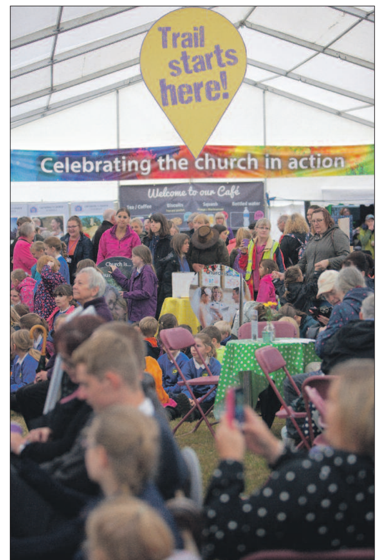
The Diocese of Norwich marquee at last year's Royal Norfolk Show.