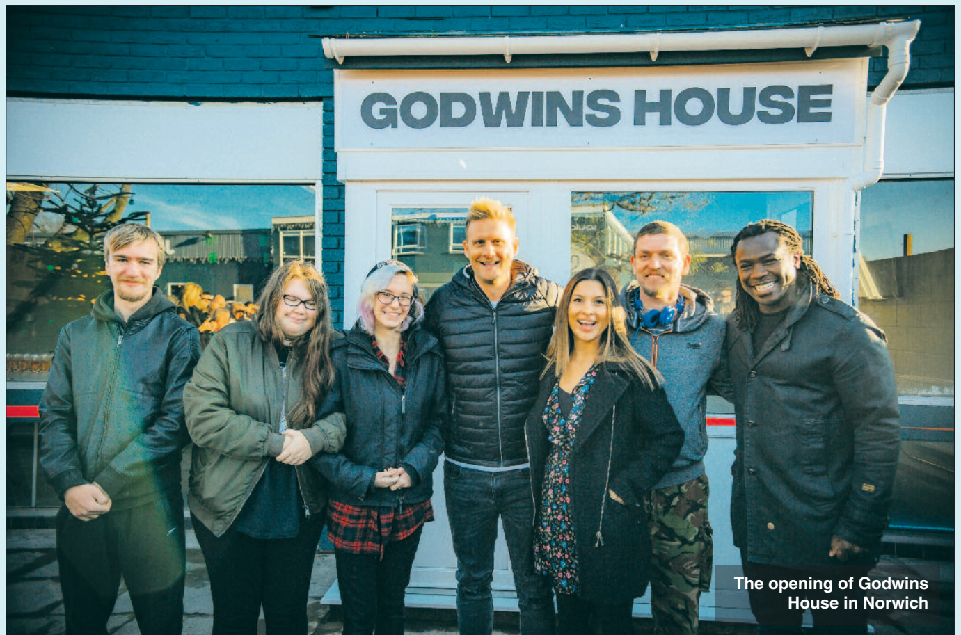
The opening of Godwins House in Norwich

If you'd like to find out more about the outreach programmes run by Soul Foundation and their partners, please visit www.soulfoundation.co.uk