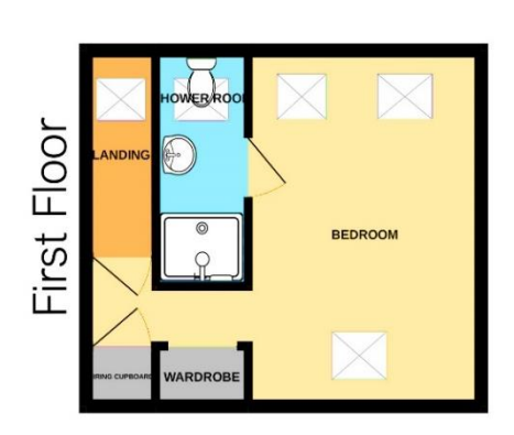
The Garden Apartment at Quiet Waters

We are aware of our Covid responsibilities and are taking all necessary steps to ensure your safety. The Garden Apartment will be thoroughly cleaned and sanitised in between guests.